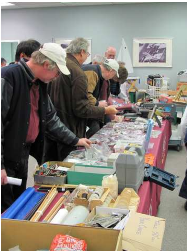
The Metro Marine Group holds a season ending swap meet, a great idea!