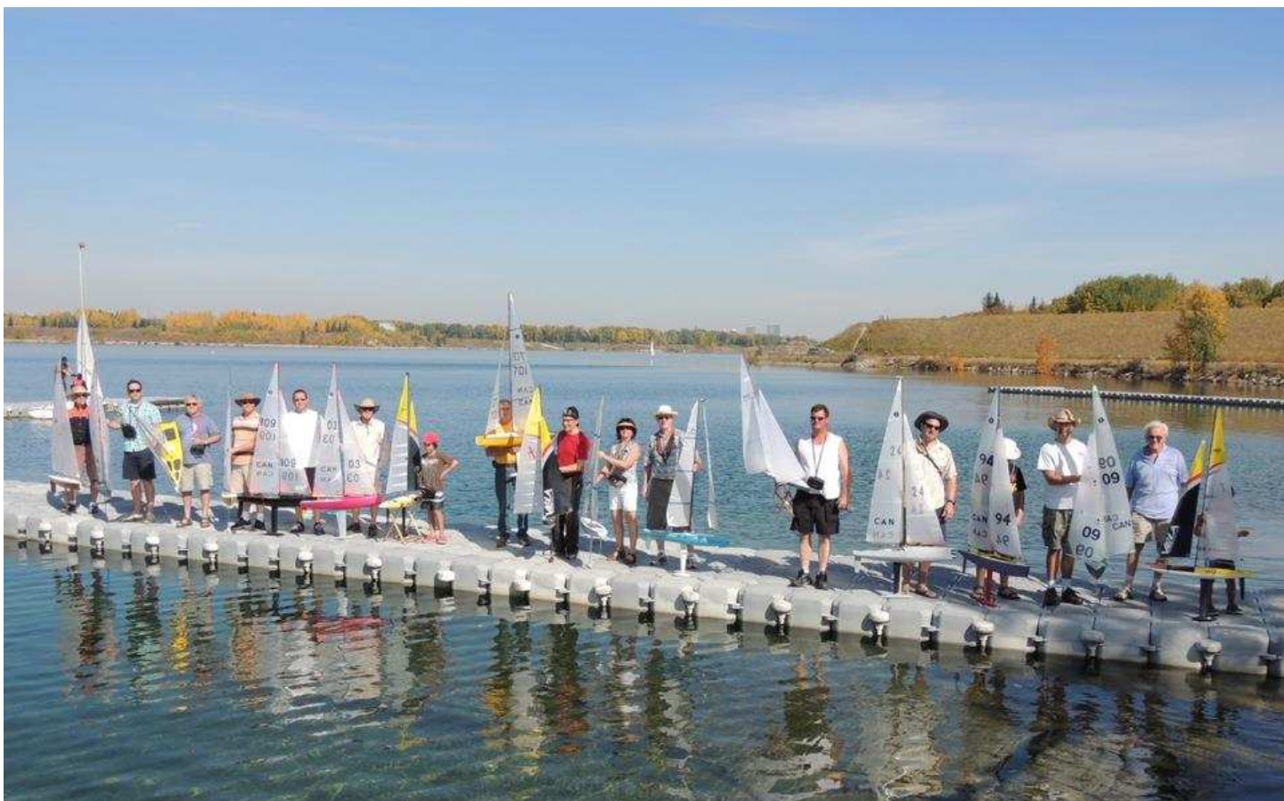
Assembled competitors and boats for the Calgary Model Sailing Assoc. September Blender trophy.