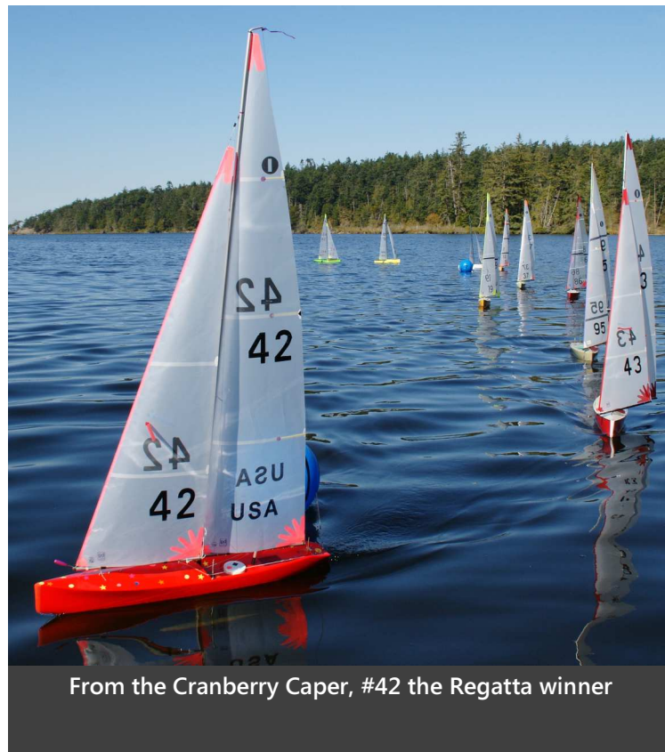
From the Cranberry Caper, #42 the Regatta winner

One great thing about our events in the CanAm Series is that you could not wish to sail with a