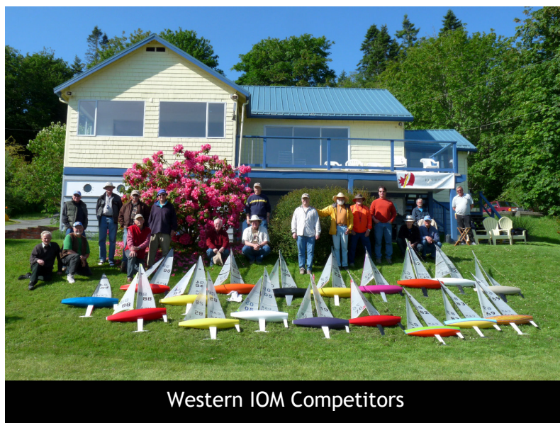
Western IOM Competitors