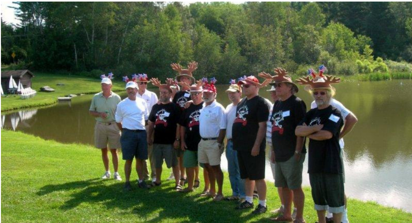
Team Canada sporting the black "Pirate" Shirts and Moose horns are joined by Team USA wearing the "Stars and Stripes" hat adornments.