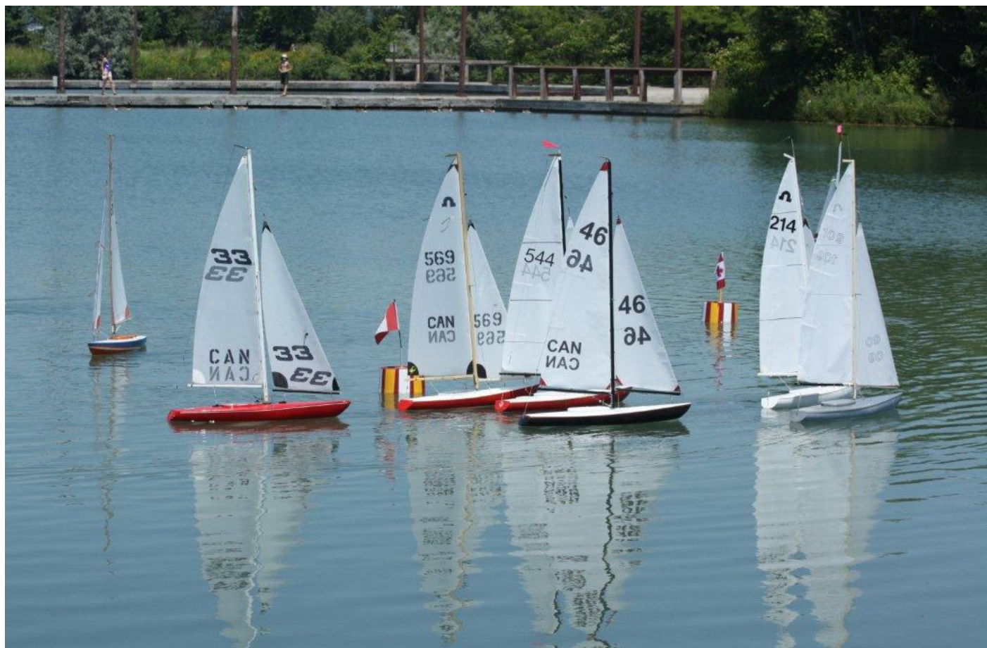
Light air on Sunday at the Soling 1 M regatta in Toronto, when you can read the sail numbers in the reflection you know progress will be slow.