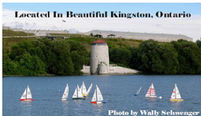
Located In Beautiful Kingston, Ontario

Pe-Ka-Be Victor Models Sails Etc. Thunder Tiger Graupner Robbe Pro-Boats Great Planes Kyosho