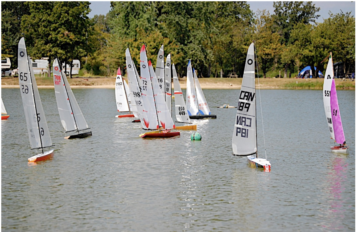
US One Meters are from the annual Maurice Diet Memorial One Meter regatta at the Windsor Model Yacht Club online at www.windsormodelyachtclub.com

Here in Kingston, the IOM fleet has developed a net system in an attempt to protect the race course area from floating weeds. Made from a tennis net cut in two lengthwise with pool noodles to keep the top afloat, the net is strung from the shoreline and anchored at the outer end. This has proven to be relatively effecting since there is a slight current from west to east and the prevailing wind is southwesterly. Under normal conditions the net can be placed at the west of the