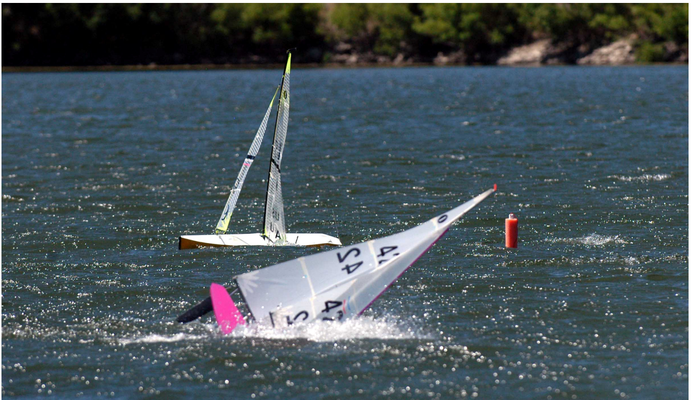
Glamrock Sail Number 42 takes a dive while testing the heavy air at the Hood River Event.

Everyone showed solid skipper ability working the boats around the course. Despite some struggles, it appears the skippers had a lot of fun and more experienced sailing in the Big wind.