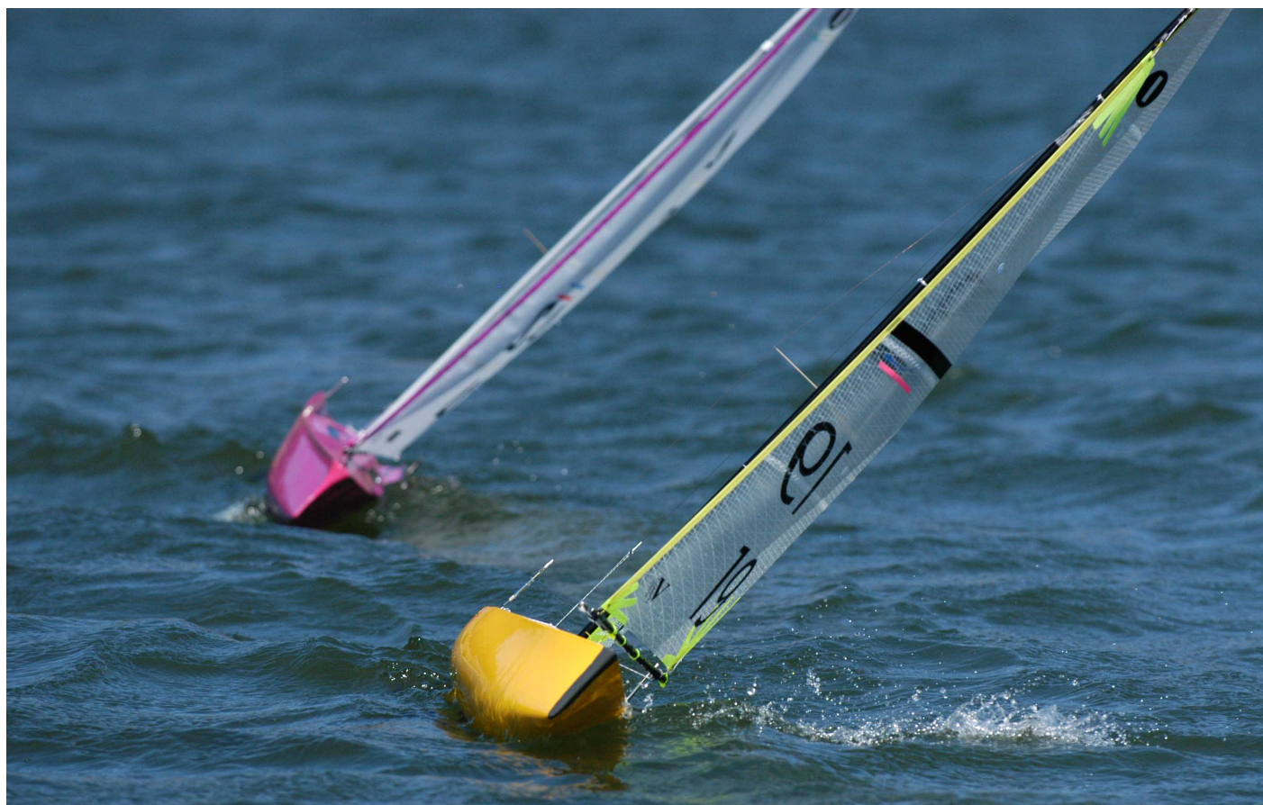
IOM's going to weather in the heavy air at the Hood River Event.