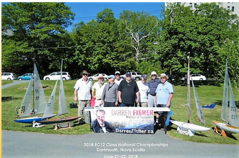
2018 EC12 Class National Championships Dartmouth, Nova Scotia June 21-22, 2018