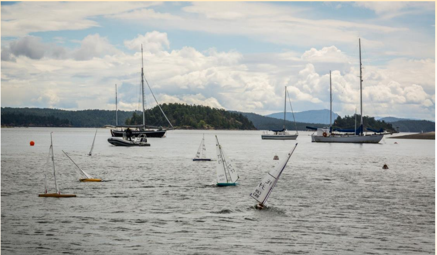
Looking South at the course when a gusty catspaw interrupts the light wind at prestart. Sometimes the catspaws dissipate back to light wind and sometimes it leads a new stronger wind. Not easy for race management to resolve and hopeless for those with bendy masts to find a good average tune.

After my first experience what do I think of the Simple Heat Racing System? This is one example where HMS probably would have some different results than SHRS because the abbreviated Final Round left no throw-outs in this round, so a few "bad races" had folks dropping in the final standings. For example, Jerry Brower throws out a 4th and keeps two (2!) DNFs. In HMS those "bad finishes" go to throw-outs. That said, it was the same system for all and I don't care what system we race under. I see advantages in SHRS to get more races off quickly in the Final Round with skippers permanently grouped together with others of similar ability. I am also predisposed from familiarity to prefer the HMS philosophy that in every race you have the opportunity to start in the best fleet and/or be demoted to a lower fleet.