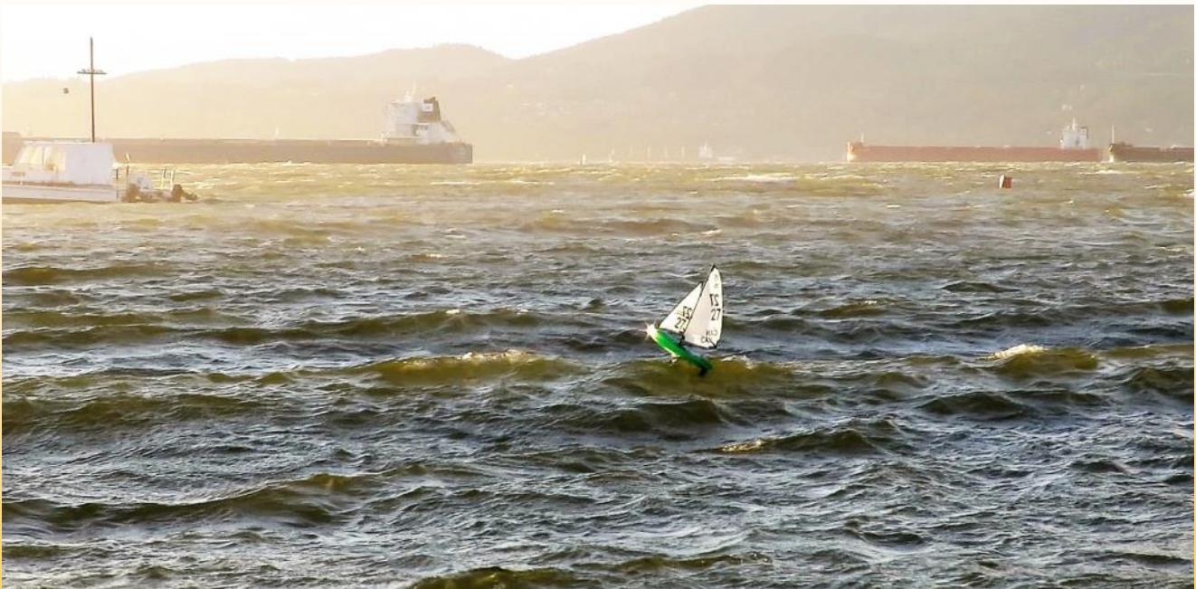
On the West Coast, not only do we have breaching Orcas, but also jumping Dragon Force 65s!

If you have interesting photos you would like to showcase here, please email them to communications@crya.ca